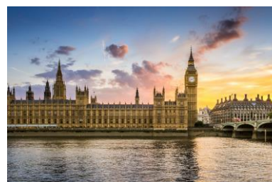
The Houses of Parliament

Remember, remember, the 5th of November.