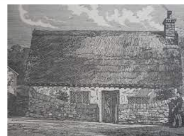
Sir John Barrow Cottage